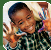
When hands are dirty