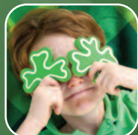
Before snacks and meals