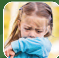
When you or someone around you is ill