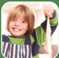
When preparing food