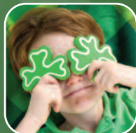
Before snacks and meals