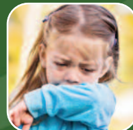
When you or someone around you is ill