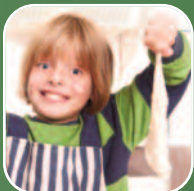
When preparing food