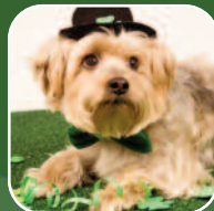
After touching animals