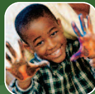
When hands are dirty