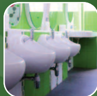
After using the restroom